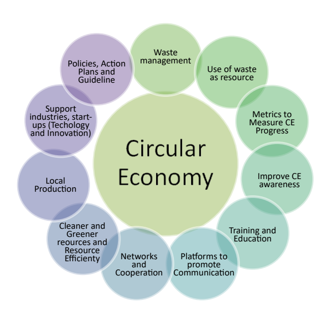
Figure 2. Ideal Scenario: Research Outcome. Source: Fux, 2018.

Volume 16, Número 1, 2019, pp. 157-165 DOI: 10.14488/BJOPM.2019.v16.n1.a15